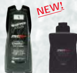
Wireless Paging at the Touch of a Button