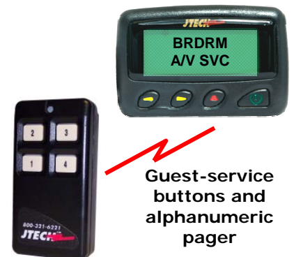
Guest-service buttons and alphanumeric pager