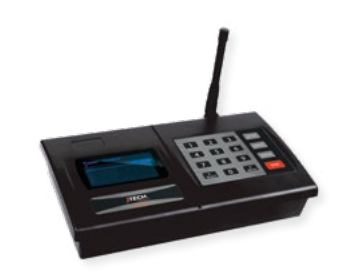
IStation Transmitter Pager Alerts Only (Optional)