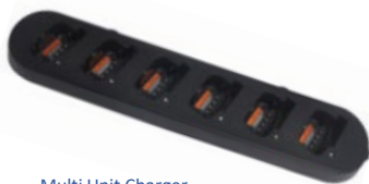
Multi Unit Charger w/ power supply